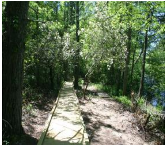
Trail going south with Mountain Laurel