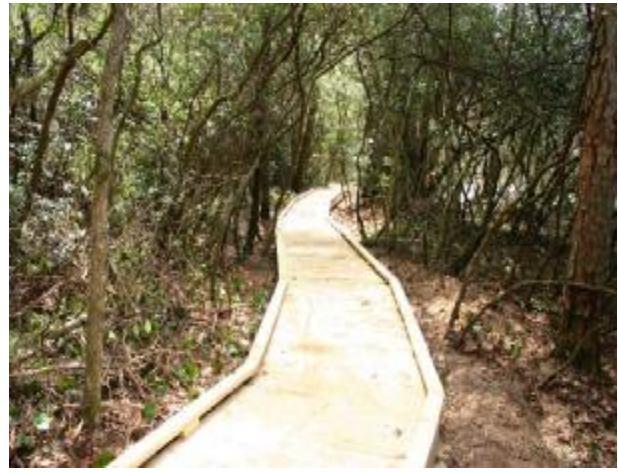
Trail passing through Laurel thicket.