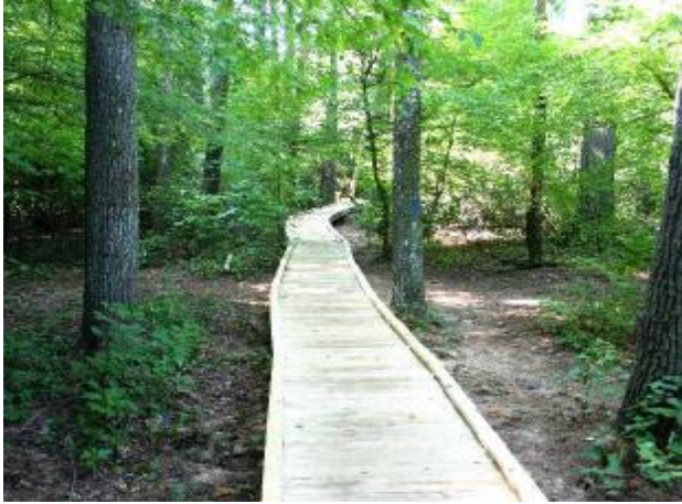
Trail going south toward rapids.