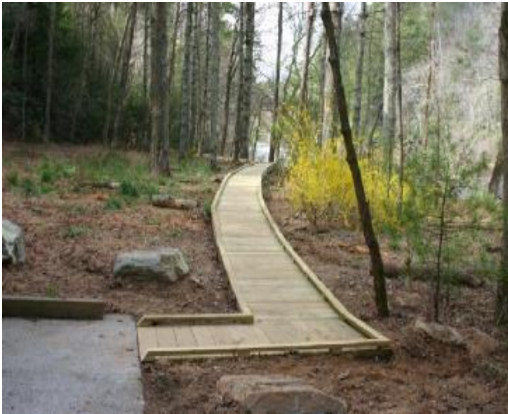
Start of trail at handicap parking area.