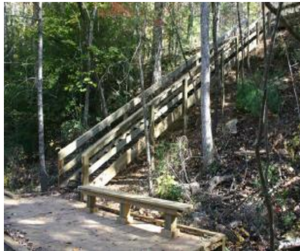
At the bottom of the stairs is the 2 nd rest stop bench.