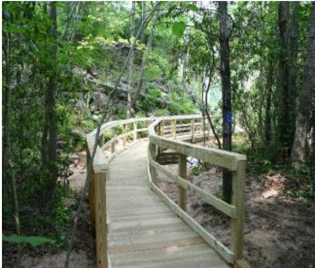
Foot Bridges are built over creeks.