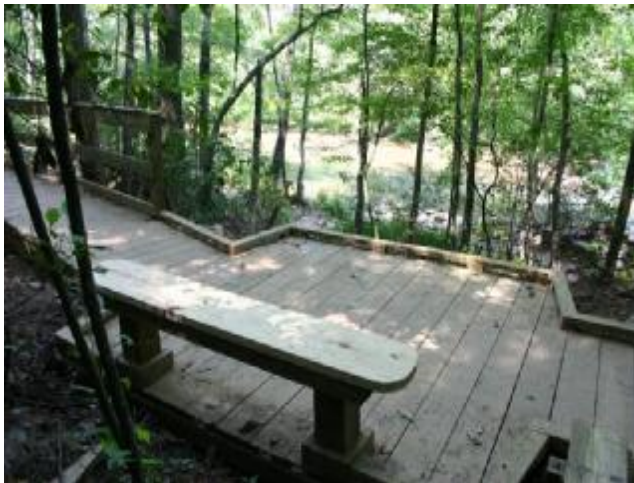
Rest spot south of the bridge where the circa 1860 covered bridge was located crossing over Amicalola River.