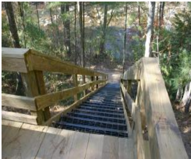
From upper parking lot there are stairs going down to the walking trail.