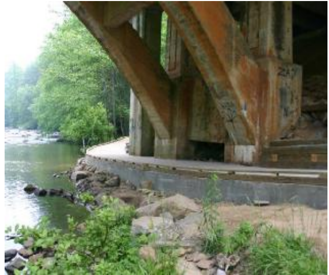
Trail going under the Rt. 53 highway bridge