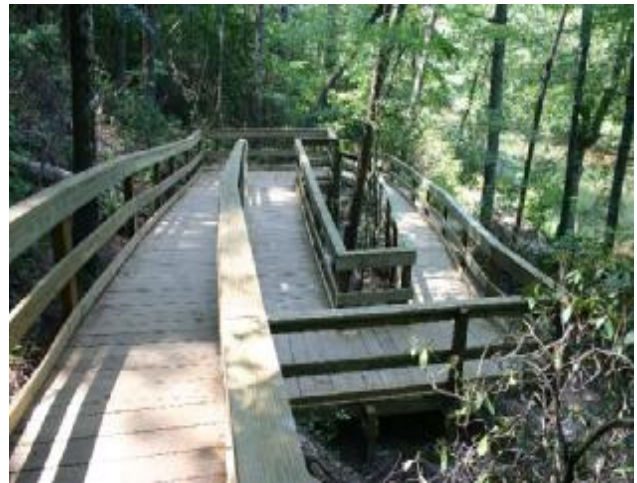
Ramps built to ADA standards are located on the trail where elevation changes require them.