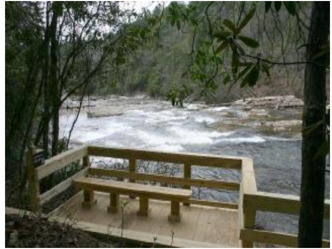
Platform at rapids with wheelchair parking.