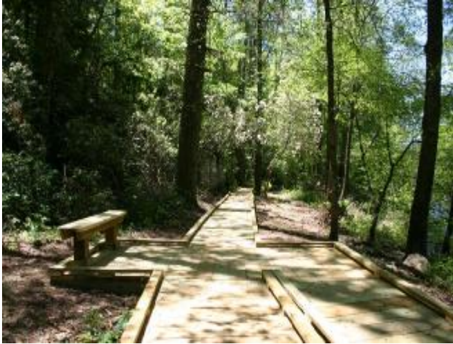
First rest stop along trail located every 200 ft.