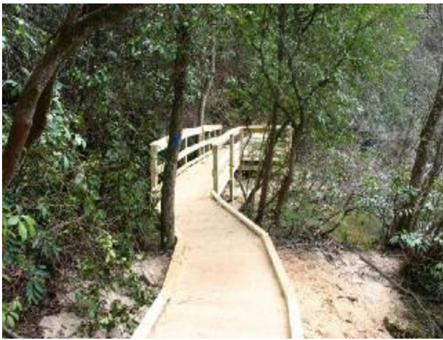
Trail approaching observation platform.