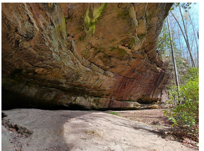
Rockhouse Sacred Site

The Rockhouse Sacred portal site is located under a large rock overhanging the area with a sandy bottom. This site was a Uchee sacred site used in spiritual ceremonies involving their tribal Supreme Being. Today, it is an ascension portal defined by a 49-ring Geospiral and upwelling energy lines. A Protective heavenly spirit guards the location acting as the gatekeeper. The portal area is within the boundaries of a rectangular area defined by earth energy lines. The rectangle has dimensions associated with PI.